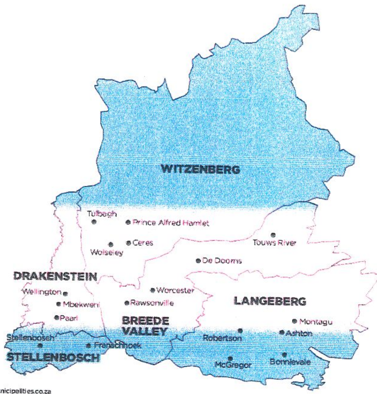
MAP 1.1: The local municipalities located within the district, as well as the hierarchy of the main towns within each local municipality.