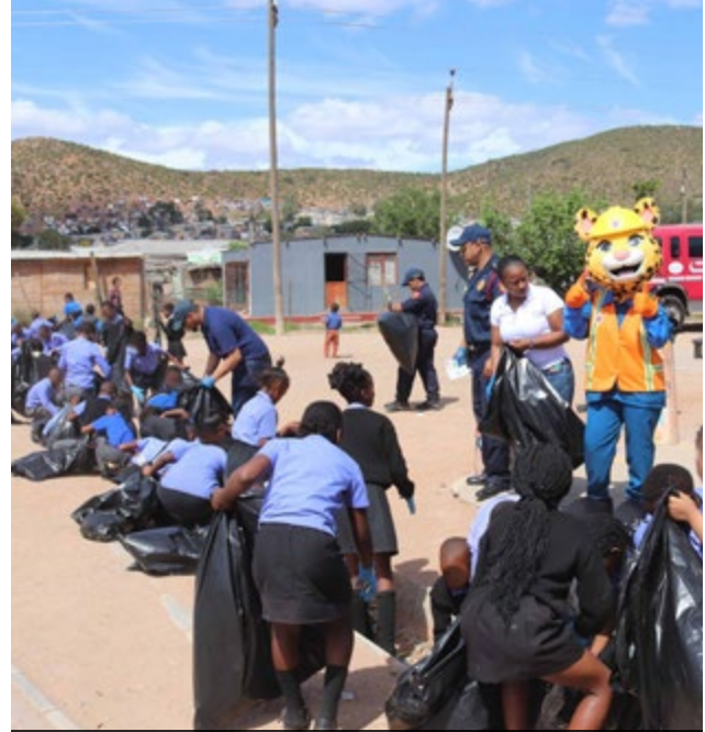
Cleaning the community reduces flooding