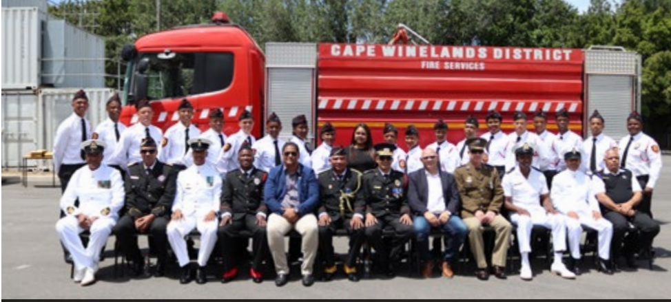
Breede Valley Municipality's Passing Out Parade 18 November

ngolwesiNe wama-24 kuNovemba, iZiko leMfundo laseCWDM soQeqesho kuCimo Mlilo noKhuseleko eStellenbosch sisindleke iphareyidi yokuphumelela kwabafundi kule miba, ngokusemthethweni ngeNtwasahlobo yonyaka wama- 2022. Le nkonzo ililifa elide nelakhayo, elidluliselwa kwisizukulwana ngesizukulwana yaye ikhuthaza ukucinywa komlilo njengomsebenzi obekekileyo nowenziwa ngabantu abanobulali, nabaqeqeshekileyo. Aba bacimi mlilo baphumeleleyo nabali-19 babonakalise ingqeqesho, ukuzimisela nokusebenza kunye ngethuba bebesenza umboniso wezakhono zabo, beqinisekisa ukuba banothakazelelo, benoncumo lokuzingca neenyembezi zolonwabo, ngalo