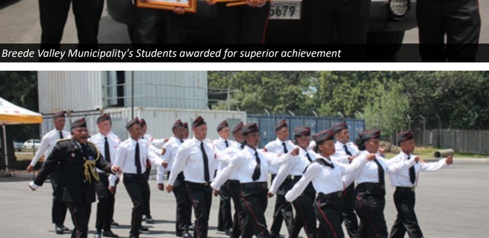
Breede Valley Municipality's Drill Squad