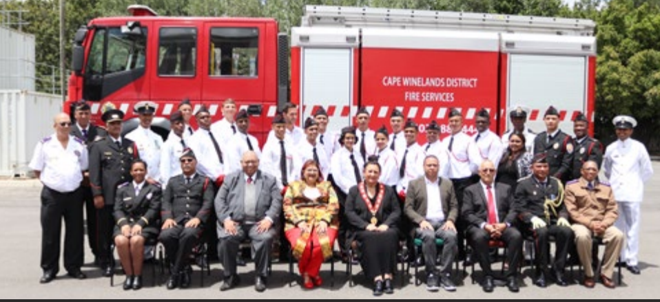
CWDM's Passing Out Parade 24 November