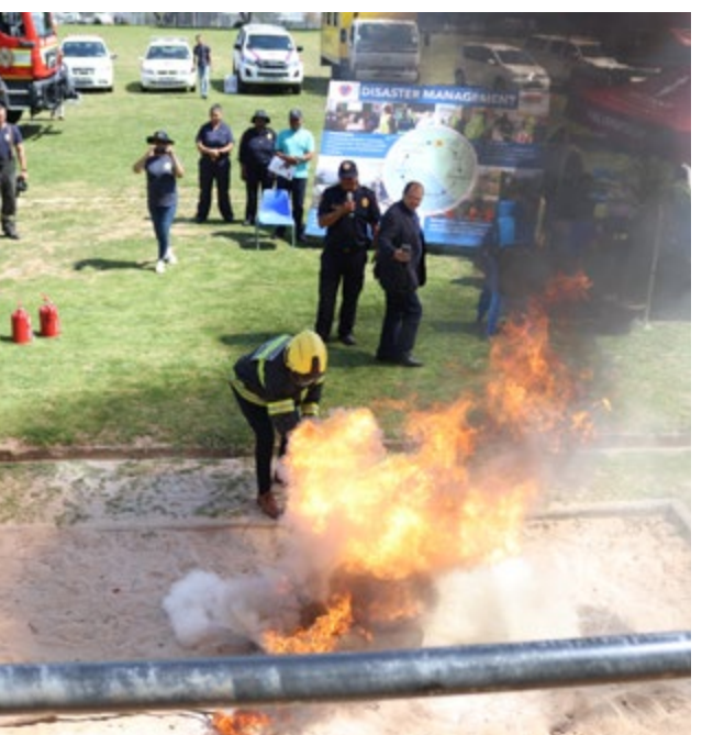
Learning how a fire extinguisher works