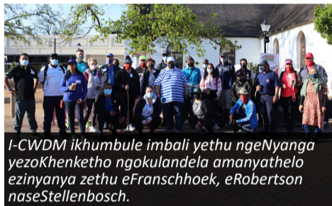
I-CWDM ikhumbule imbali yethu ngeNyanga yezokhenketho ngokulandela amanyathelo ezinyanya zethu eFranschoek, eRobertson naseStellenbosch.