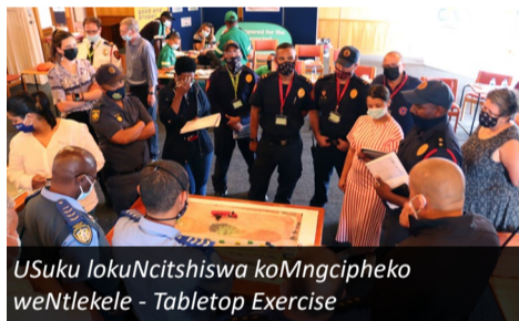
USuku lokuNcithiswa koMngcipheko weNtlekele - Tabletop Exercise