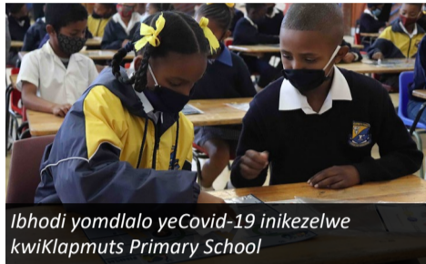
Ibhodi yomdlalo yeCovid-19 inikezelwe kwiklaphmuts Primary School