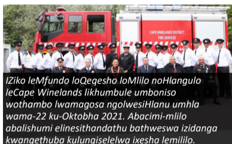
Iziko leMfundo loQeqesho loMlilo noHlangulo leCape Winelands likhumbule umboniso wothambo lwamagosa ngolwesiHlanu umhla wama-22 ku-Oktobha 2021. Abacimi-mlilo abalishumi elinesithandathu bathweswa izidanga kwangethuba kulungiselelwa ixesha lemililo.