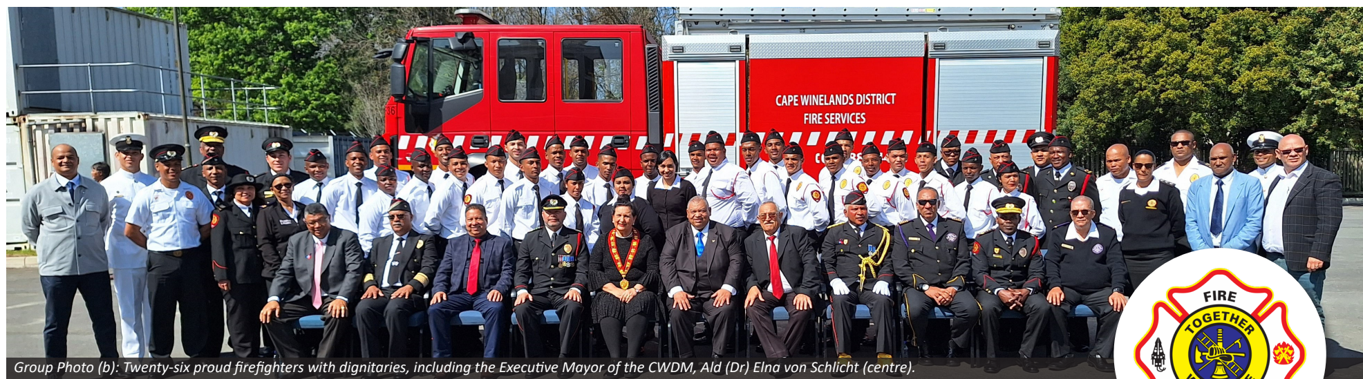
Group Photo (b): Twenty-six proud firefighters with dignitaries, including the Executive Mayor of the CWDM, Ald (Dr) Elna von Schlicht (centre).