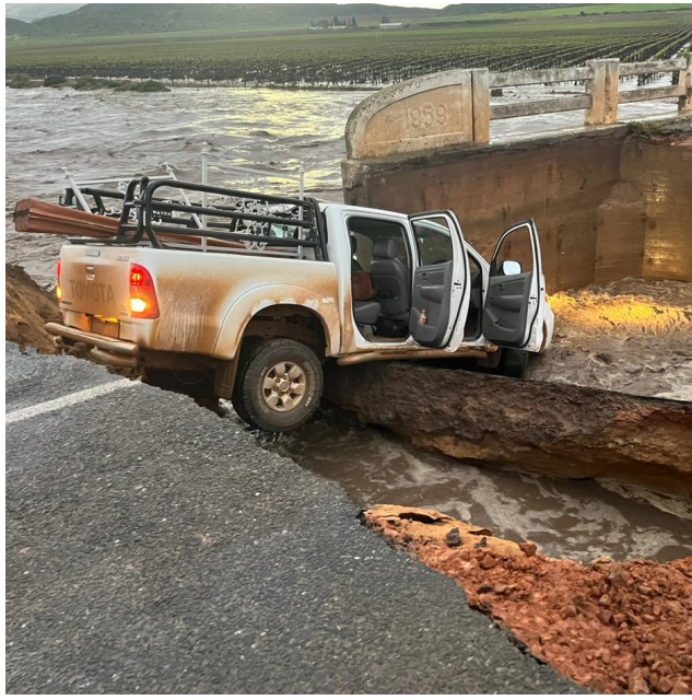
The flooding that affected the Cape Winelands (Overberg and Somerset West) over the long weekend of 22 to 25 September will be remembered for many years, especially by those who were directly impacted.

In response to the announcement by the South African Weather Services (SAWS) that they were upgrading the weather alert from level 4 to level 9, the Cape Winelands District Municipality's Disaster Management Division activated all stakeholders and role-players, which included provincial departments operating in the district and all the local municipalities.