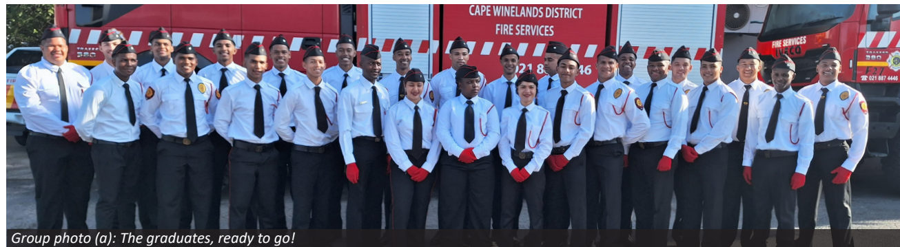
Group photo (a): The graduates, ready to go!