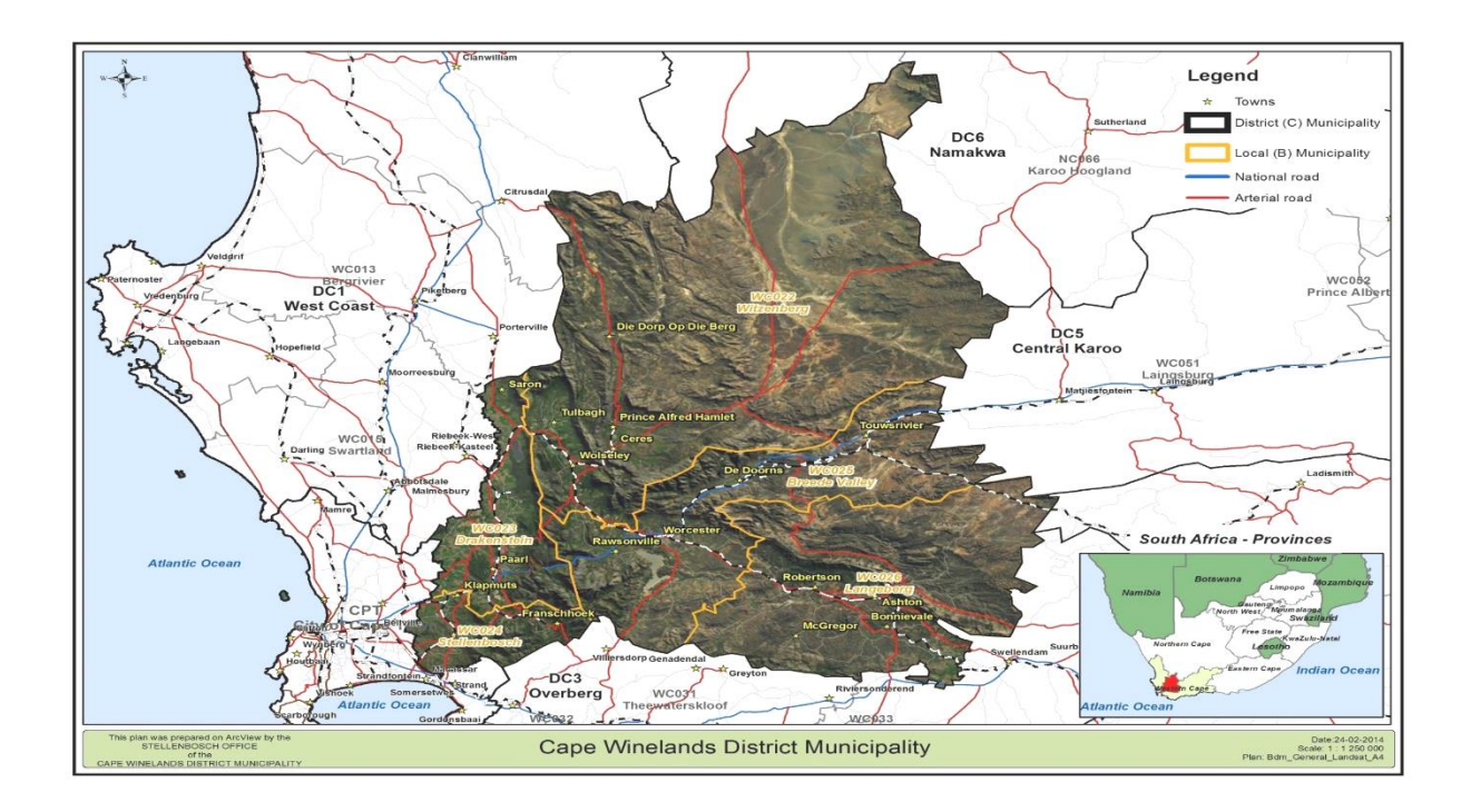
Map 1: Jurisdiction of Cape Winelands District Municipality (DC2) that includes the local authorities of Stellenbosch, Drakenstein, Langeberg, Breede Valley and Witzenberg.

The Cape Winelands District Municipality's (CWDM) jurisdiction includes the local authorities of Stellenbosch, Drakenstein, Breede Valley, Langeberg, and Witzenberg as reflected in Map 1 and CWDM has its own road maintenance teams situated in Stellenbosch, Paarl, Worcester, Robertson and Ceres performing a road maintenance function on the provincial road reserves.