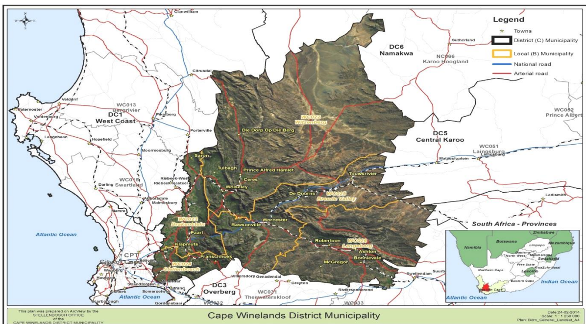
Map 1: Jurisdiction of Cape Winelands District Municipality (DC2) that includes the local authorities of Stellenbosch, Drakenstein, Langeberg, Breede Valley and Witzenberg.

The Cape Winelands District Municipality's (CWDM) jurisdiction includes the local authorities of Stellenbosch, Drakenstein, Breede Valley, Langeberg, and Witzenberg as reflected in Map 1 and CWDM has its own road maintenance teams situated in Stellenbosch, Paarl, Worcester, Robertson and Ceres performing a road maintenance function on the provincial road reserves.