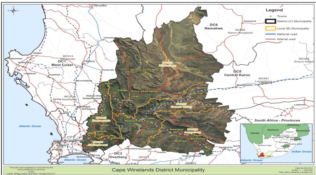
Map 1: Jurisdiction of Cape Winelands District Municipality (DC2) that includes the local authorities of Stellenbosch, Drakenstein, Langeberg, Breede Valley and Witzenberg.

The Cape Winelands District Municipality's (CWDM) jurisdiction includes the local authorities of Stellenbosch, Drakenstein, Breede Valley, Langeberg, and Witzenberg as reflected in Map 1 and CWDM has its own road maintenance teams situated in Stellenbosch, Paarl, Worcester, Robertson and Ceres performing an agency road maintenance function on the provincial road reserves.